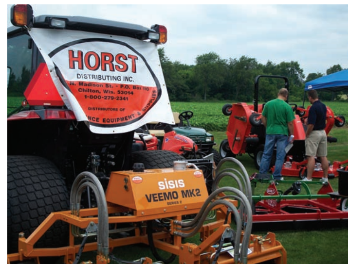
The large trade show allows you to compare all different makes and brands in one location.