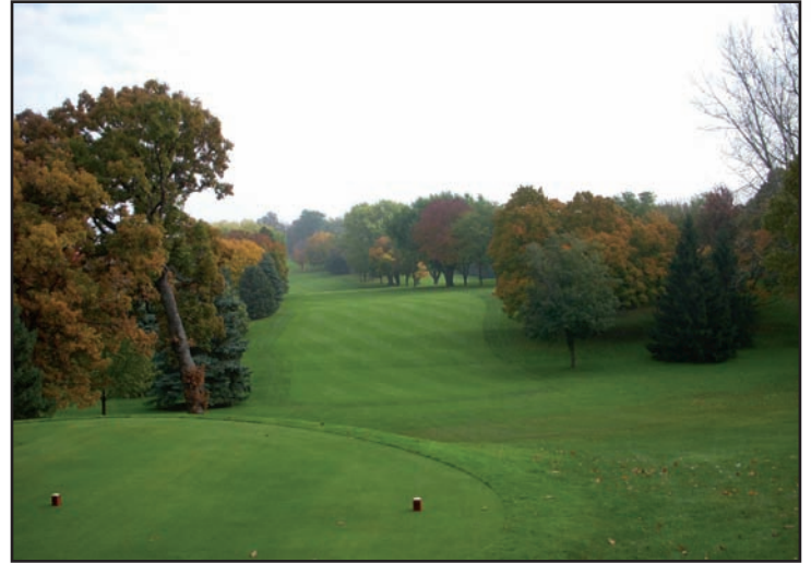
Beautiful fall colors will greet you on your October 4th visit