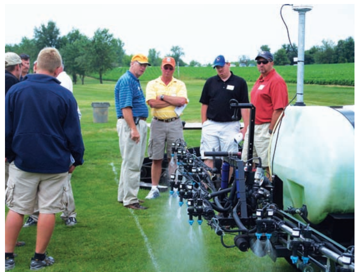
Sprayers and new pesticide management strategies will be intently discussed on the research tour.