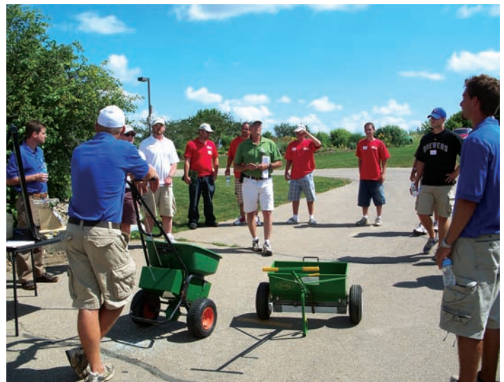
The optional lawn care training session provides hands-on training for you or your staff to brush up on practical turf management

Though the afternoon is designed for lawn care technicians who directly manage homeowner and commercial properties, turfgrass managers of all stripes will stand to learn something they can take back to their facility. Once again, attendance will be limited to provide for a unique interactive experience for all attendees. Look for the afternoon session registration form to be included with the Summer Field Day registration. Attendees will be accepted on a first come, first serve basis and capped at 65 entrants, so be sure to return your form promptly to ensure your attendance. We look forward to seeing you there! ■