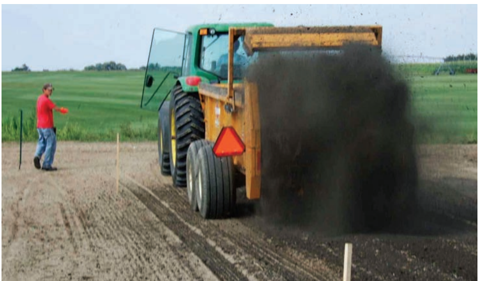
Application of biosolids through traditional ag equipment to sod production field, August '09