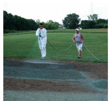
New hydroseeding strategies, like this, will be explained at field day.

also appear in all your individual association newsletters or can be downloaded from the WTA website - www.wisconsinturfgrassassociation.org . Also new this year, you may pay online if so desired. Field Day 2010 is going to be the best ever, and I hope you can fit it in - July 27th. ■