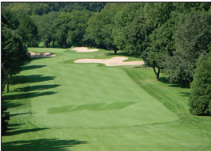
Hole #10 offers both beauty and challenge