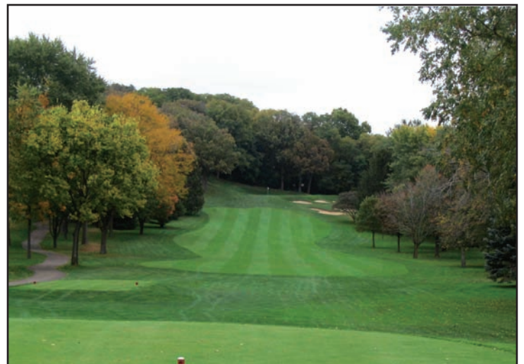
Green #9 is nestled into the bluff and woods of Shorewood Hills

Download registration form at www.wisconsinturfgrassassociation.org