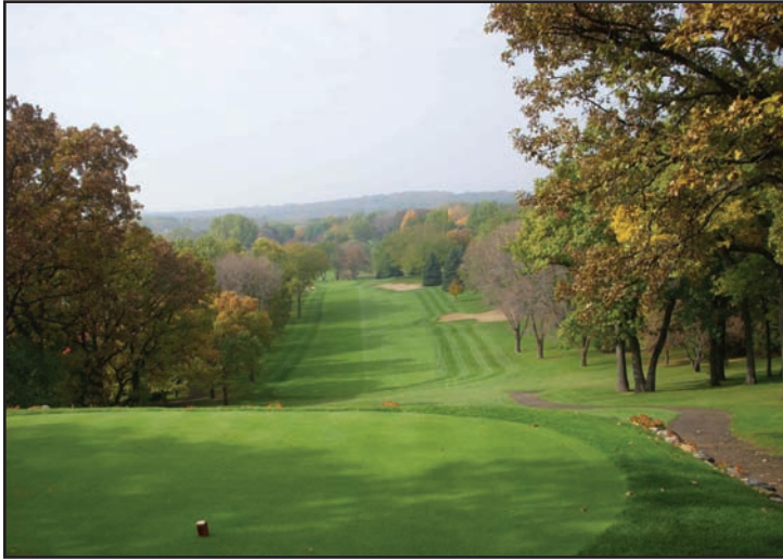
The elevation from tee #1 allows you to really send your ball soaring westward