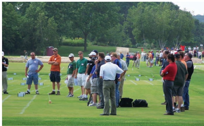
Crowds gather for the ever popular Research Tour at Field day 2008

A return of the successful lawn care session that was introduced at the 2008 field day will return for 2009. The session targets hands-on identification of turfgrass species, weed species, diseases, and insects as well as fertilizer and pesticide calibration. Though the program is still being finalized, new