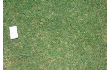
One of the diseases that superintendents struggled with in Southeast Asia is bermudagrass white leaf. This disease is caused by a mollicute and is transmitted by leafhoppers.