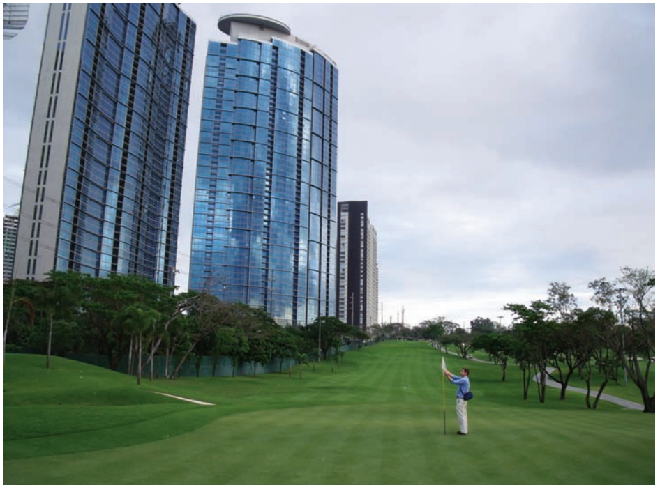
One of the holes at Manila Golf Club in the Philippines. There was a shade issue from the buildings on these holes, also a slice could be very bad!