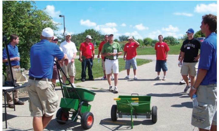
Fertilizer calibration was also part of the 2008 lawn care workshops