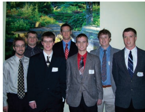
2009 UW-Madison Turf Scholarship Recipients

Well, that's a wrap of EXPO for 2009. The new location, time, and cost were a big hit. The education presented so many new ideas. And the final part of EXPO, Wisconsinizing, was a great way to wind down after this great day of education and concluded a great way to start the new year. ■