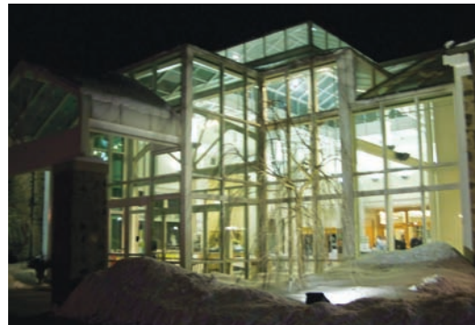
Boerner Botanical Gardens, the new location for EXPO, as seen in the evening