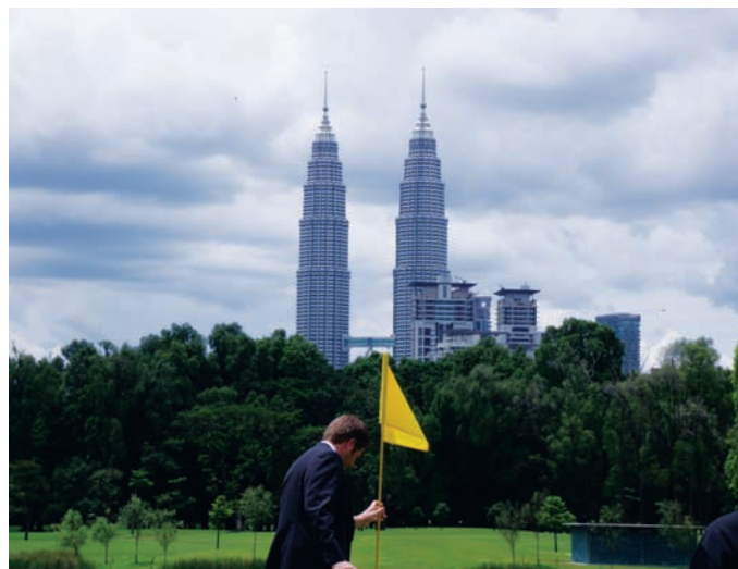
Picture from Royal Selangor Golf Club with the towers of Kuala Lumpur in the background.

Finally, what were the diseases of importance in Southeast Asia? Leaf spots can be problematic during the rainy seasons and so can bermudagrass decline. Dollar spot was a huge issue on courses with seashore paspalum, so I felt somewhat at home having experience with this turf during my studies at North Carolina State where this turf grows along the coast of Carolina. The superintendents do not have the selection of fungicides that we have in U.S., so disease control can be challenging at times. However, the climate in Southeast Asia is perfect for zoysiagrass and almost perfect for bermudagrass, so if they select the